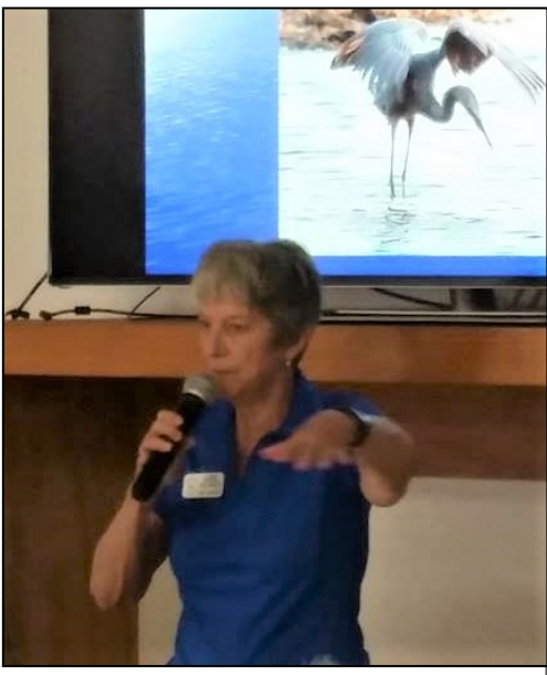
About Water Birds, Snakes, and Turtles