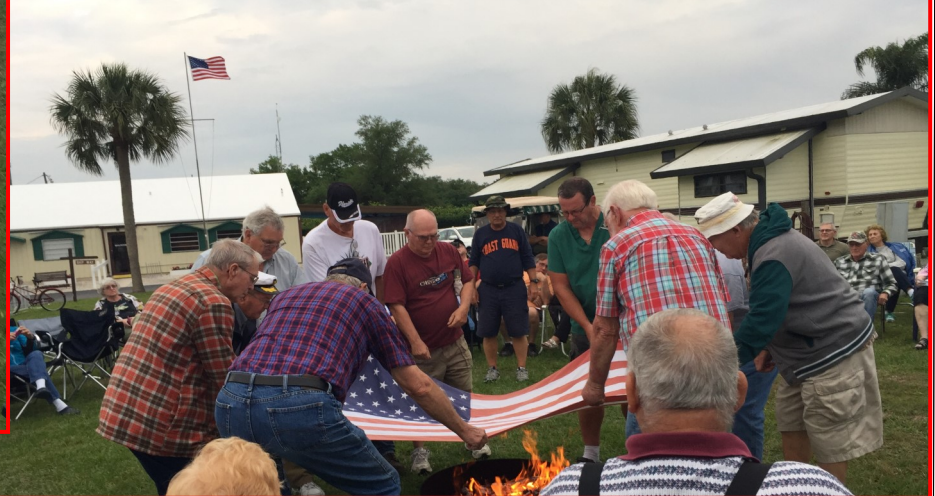
Proper Flag Retirement Is to Burn It