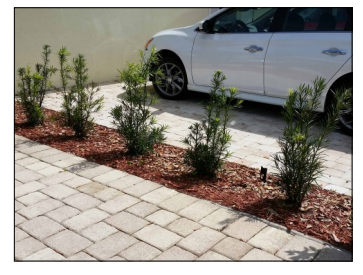
When first planted, our shrubs will look like this.

They are being replaced with podocarpus, a handsome and hardy low-maintenance shrub that does well in sun or shade. It is a conifer that is drought-resistant once it is established. It's evergreen, salt-tolerant, and cold tolerant, so it does well in any area of South Florida.