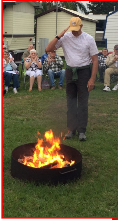
Burning Individual Stars & Stripes in Memory of Those Who Served.