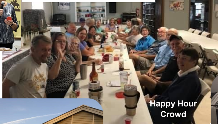
Happy Hour Crowd