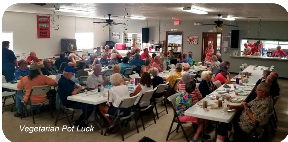
Vegetarian Pot Luck

I think there could be another vegetarian potluck in our future!