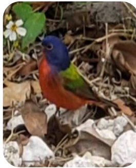
Dick & Nancy Pearce caught a picture of this beautiful painted bunting in the park.