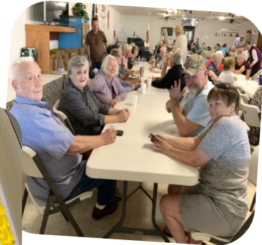
Visitors and members all joined in the festivities