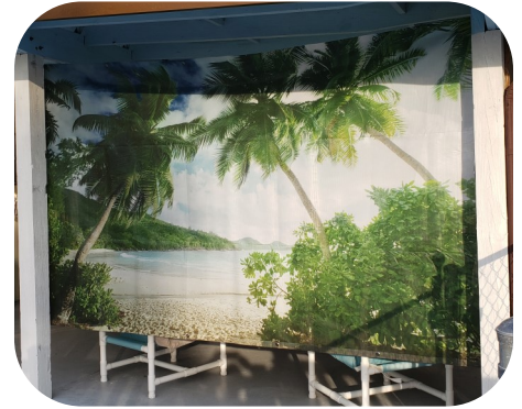
The White B4 Dine crowd in particular will enjoy this attractive shade cloth at the pool patio as the sun heads farther north.

It's located in the clubhouse storage room. Please sign it out in the kitchen. You will need to provide your own propane tank.