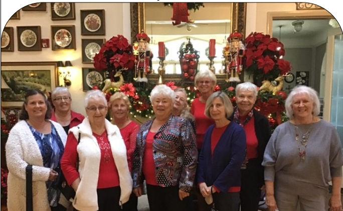
Annual SKPettes Lunch at Hotel Jacaranda