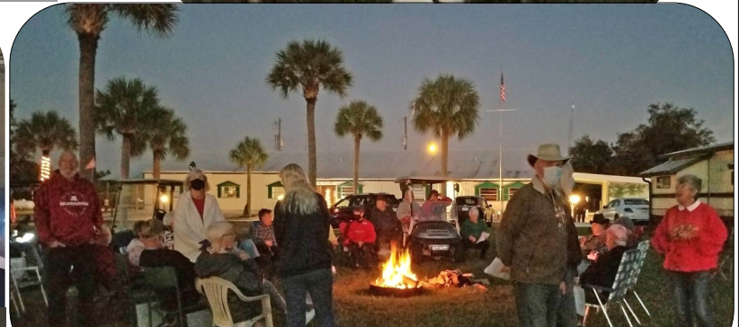
Campfire following Christmas caroling.