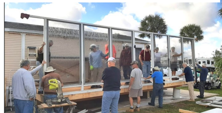
Room Raising at the Landrys