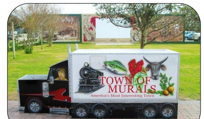
One of the many trash cans around town.

One local gem Norm and Ginny Milliard recommend and Tripadvisor's #1 attraction and 2020 Travelers' Choice is the Murals of Lake Placid. Lake Placid is located 35 miles southeast of the Resort, about a 40 min. drive.