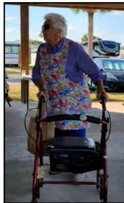
Miss Vera models a lovely apron during the auction