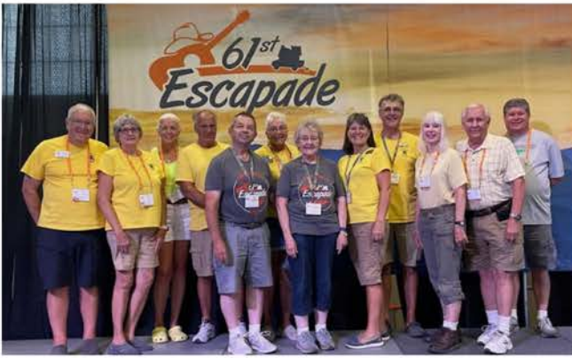
FL SKP Resort Escapade Attendees