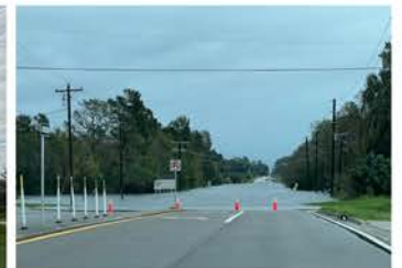
State Road 64 E beyond US 17 in Zolfo Springs

PLEASE NOTE: The Clubhouse Founders' Hall IS NOT engineered as a hurricane-proof shelter. Therefore the Resort can not assume responsibility for members using it as such.