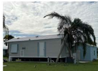
Palm tree down on Lot H-40

We have much to be grateful for as you will see when you come into the area. We came through relatively unscathed compared to those surrounding our park. We withstood the storm so well. Please remember that every hurricane is different, has a different path, a different force, and we need to make sure we are prepared for it.