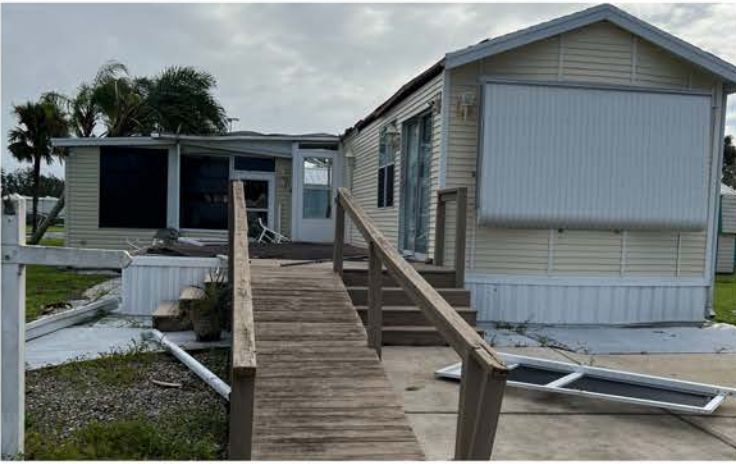
Lot A-41 Cashman Park Model