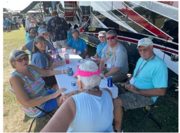
Happy Hour for the SKP Resort Escapade Attendees