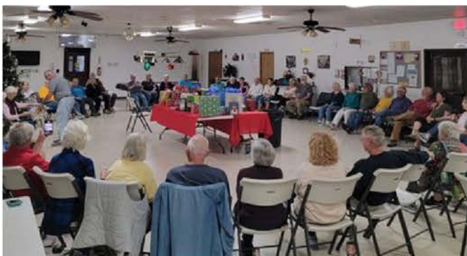
The annual Yankee Swap was well-attended and fun had by all